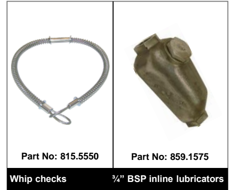
Part No: 815.5550