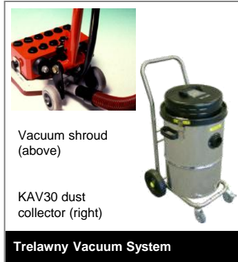
Trelawny Vacuum System