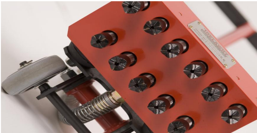
Eleven heads gives 33,000 blows per minute